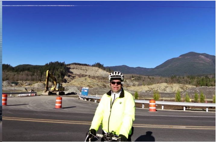
On the route with the Oso Mudslide in the background.