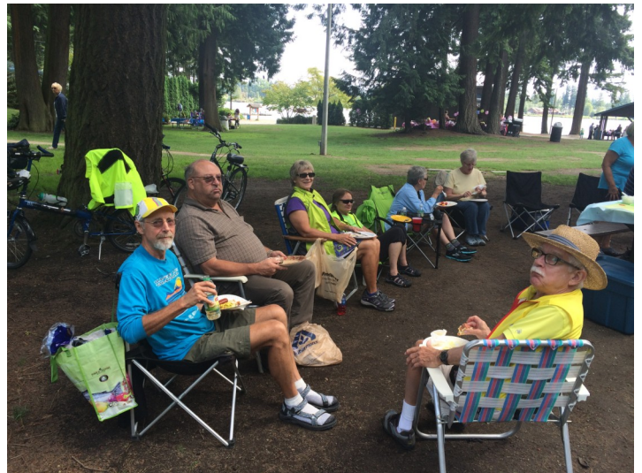
Who's ready for another ride?