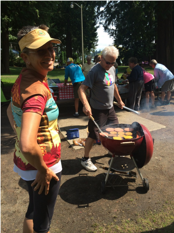
Good food and good company make for a fun picnic!