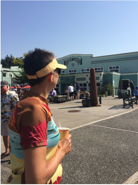
Summer in LaConner

The club meets at 7 p.m. Thursday, September 11 at the PUD, 2320 California St., Everett. If time permits you can join other members for an early dinner at El Paraiso Mexican Grill, 2801 Colby Ave., Everett starting around 5.30pm.